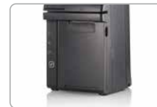
Easy Paper Roll Access

Dressed from head to toe in timeless black or white color, the only trend that never goes out of style, and with stylish touches added throughout, the HS-2410A is not just a piece of machinery, it is an elegantly crafted piece of art that looks right at home in any store decoration.