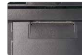
Built-in 2" Thermal Printer