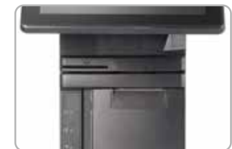
Optional Built-in MSR and RFID Reader